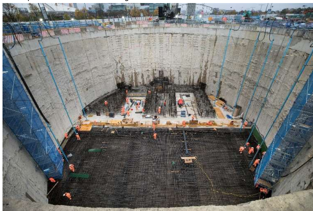
Fig.1 Rotation chamber

The installation of the diaphragm wall (underground structural retaining wall) is complete. Ground treatment to support the TBM's arrival has also been completed. Shaft excavation works to a depth of 17m progressed throughout September following the sequence of pile cropping, drilling, installation of steel reinforcement, and concrete pours to form a capping beam. In November both large pours for the rotation chamber base slab were completed. See fig.1 below. Works have started on the facing wall, where the TBM will break through, and on the plinths that will accommodate the rotation operation of the TBM. The rotation is estimated to take between 2-4 months. Works will be carried out 24/6 to complete this activity.