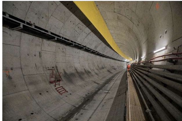
Fig. 2 South bound tunnel drive to Greenwich Peninsula

Highway diversions will also take place in the next quarter with further planned works detailed below.