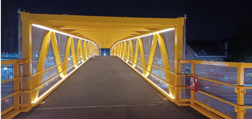
New Boord Street pedestrian and cycle bridge