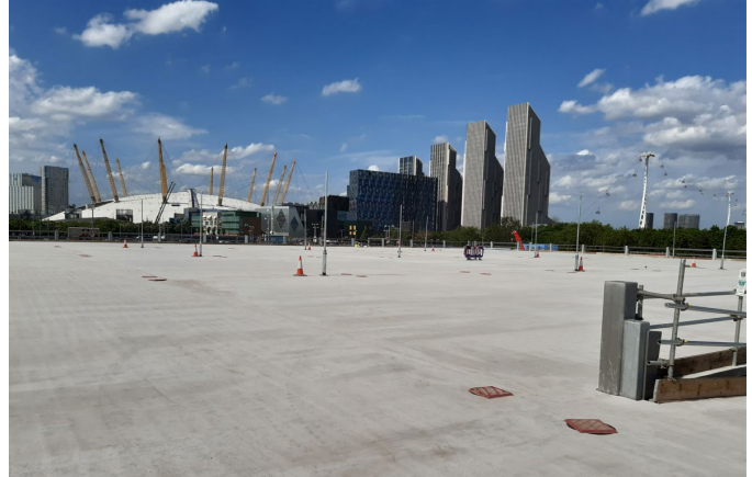
Fig. 2 Decked car park – top level