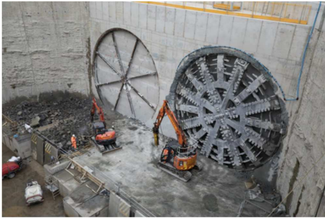
Fig.1 & 2 TBM cutterhead breakthrough

Having arrived at Greenwich (see Fig.1 & 2), the TBM will now be rotated around in pieces within a 40m rotation chamber, before beginning its 1.1km journey back under the river to the Silvertown site in Newham in the coming months. TBM Jill will be rotated in sections on nitrogen skates 180 degrees. The rotation is estimated to take between 2-4 months. Works will be carried out 24/6 to complete this activity.