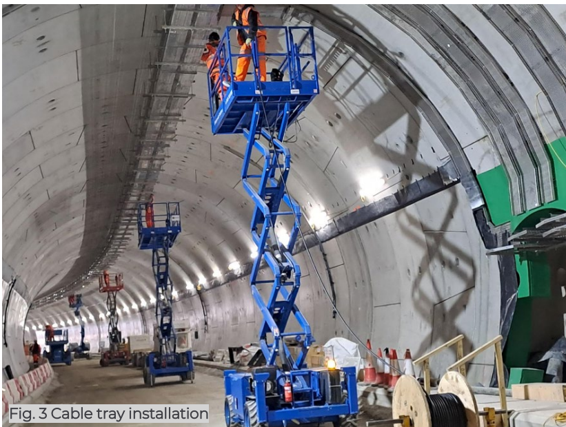
Fig. 3 Cable tray installation

Another milestone was reached in February with the completion of cable tray installation throughout the entire 1.1km stretch of tunnels and cross passages. See fig. 3 below. Cable pulling has now started within the tunnel, including the first tranche for lighting. Over the next quarter, approximately 75km of electrical cable will be fitted. Inside the South Portal building - the control room for the tunnel - internal fit out of walls, floors and services has started and windows are being installed. Over the next 3 months permanent power and high voltage equipment will be brought in to connect to the lower voltage switchgear.