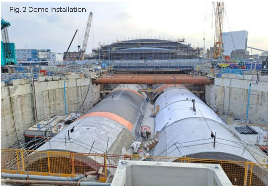
Fig. 2 Dome installation