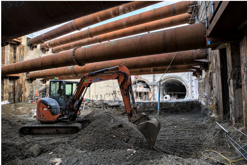
Fig. 3 Cut and Cover Tunnels

Excavation and propping works in the underground stretch of the Cut and Cover tunnel have finished, see fig.3. Reinforced concrete works have commenced to form the tunnels which will connect with the existing infrastructure as described above.