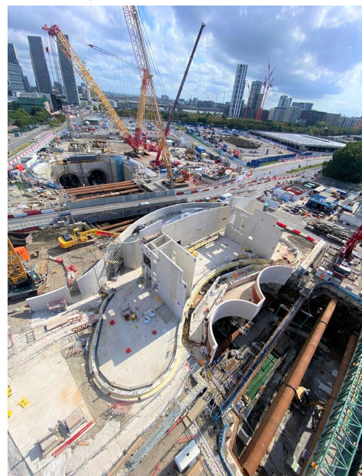
Fig.2 Silvertown Tunnel South Portal Tunnel approach – under construction (right)